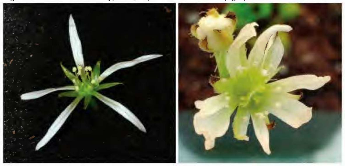
Figure 10: Dionaea flowers: 'Wacky Traps' (left) and 'St. Patrick's Beard' (right).